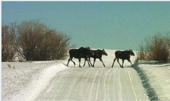
Three moose walk across a road in Pinedale, Wyoming. A Canadian team has made the short list in an international design competition to help solve the problem of dangerous roadway collisions between wildlife and vehicles.

A Canadian team has made the short list in an international design competition to help solve a worsening dilemma on roadways in many countries: dangerous collisions between wildlife and vehicles.